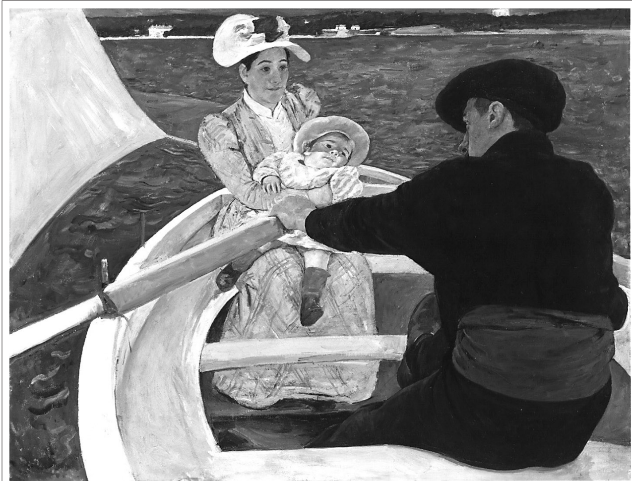
Figure 39 The Boating Party , 1893–1894 Mary Cassatt

where their health might improve. Some stories of her life assume that the family was wealthy. This is not altogether true. While they were better off than many Americans, her father was not always successful in his business dealings. Living in Europe allowed them to live better than they might have in America.