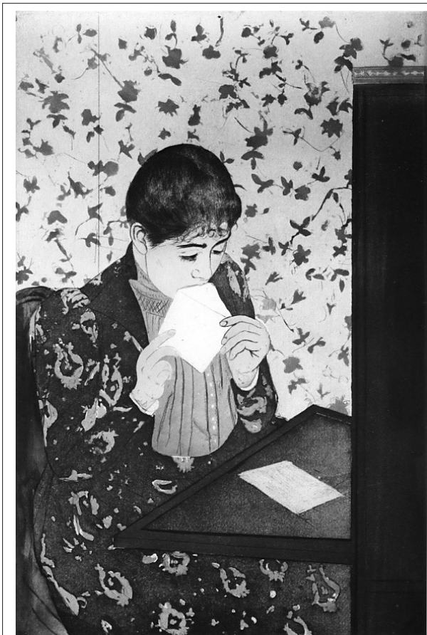
Figure 40 The Letter , 1891 Mary Cassatt

find paintings by the best artists for his private collection. She also bought a number of paintings for herself. Since she knew Americans who were visiting Europe, many of whom were wealthy, she could advise them in their collections of art. When these paintings were brought back to America, more people could learn about some of